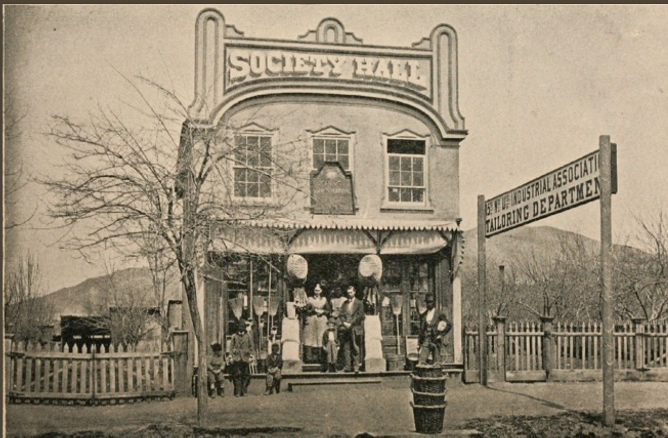
Salt Lake City Fifteenth Ward Relief Society Hall